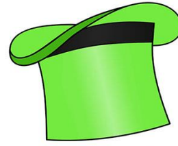
Alternatives and Creative Ideas