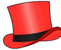
Intuition and Feelings