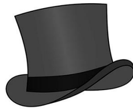
Caution, Risks, Problems